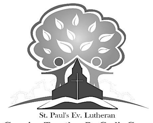
Growing Together By God's Grace